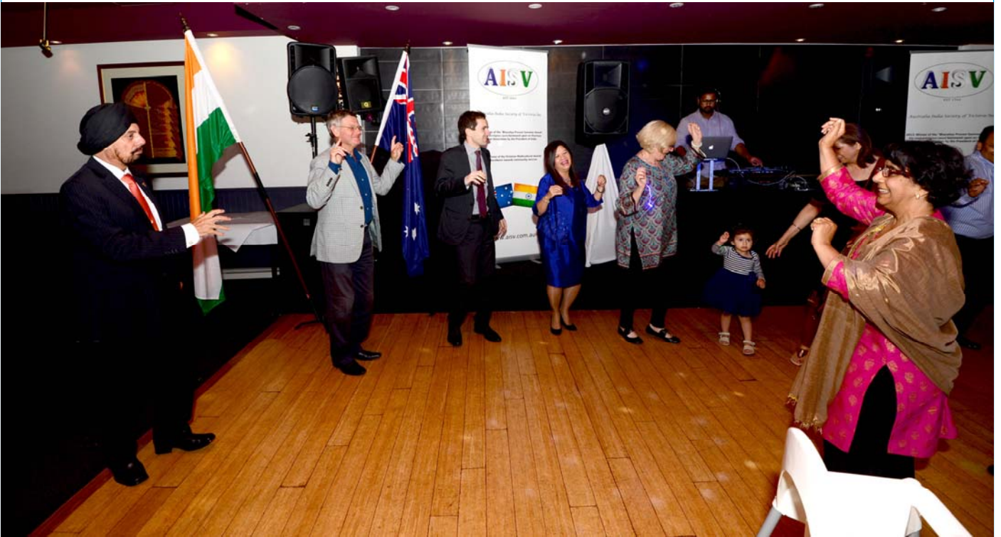
Photos from AISV Celebration of India's Republic Day / Australia Day Function at Cinnamon Club on 26th Jan 2015.

We invite you to belong to this extended family – AISV